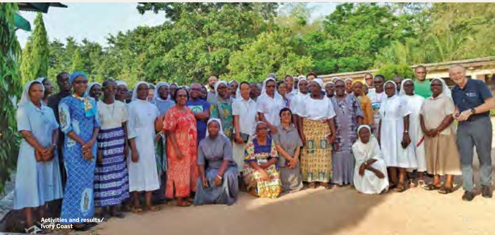
Activities and results/ Ivory Coast