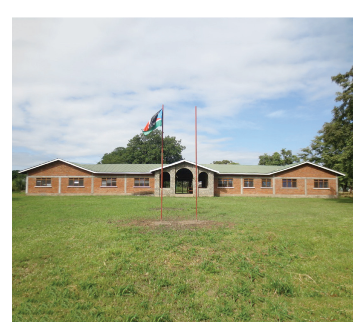
Lui Health Training Institute

Displaced people move to nearby communities, overloading already limited resources and weak services, increasing the fragility of the overall system.