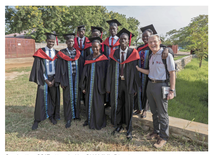
Graduation 2017, attended by CUAMM's Director

While the MoH is trying to establish internal mechanism aimed to ensure constant public funds flow to all institutes for running costs coverage, CUAMM intends to support a new intake of 20 students for Registered Midwifery Course. The intervention will consist in students living costs support, teaching and support staff salaries payment, school infrastructures maintenance and didactic materials purchase, for a total cost of about 200,000 euro.